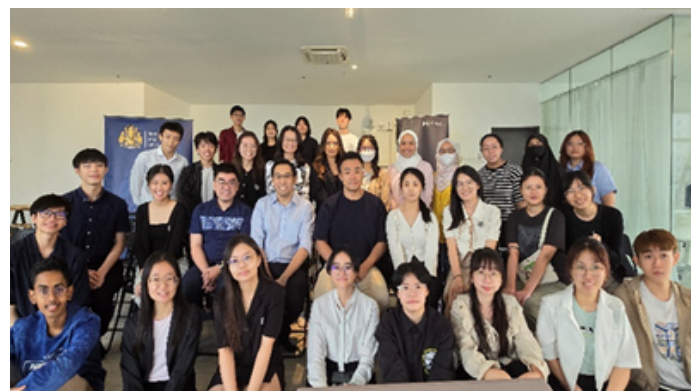
MASA Networking with IFoA: Actuarial Odyssey