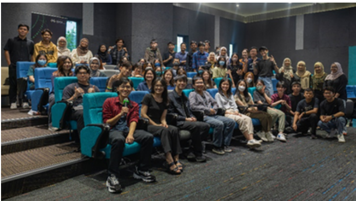
MASA Data Workshop 2.0: Prophet's Actuarial Revelation