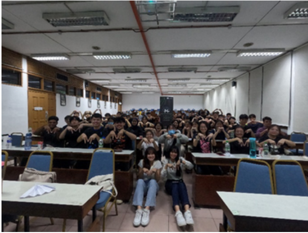
MASA Day: Bond & Unite