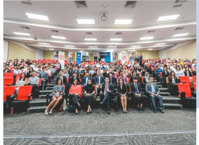
MASA Conference and Career Fair: Actuarialogy